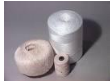
String – may be required to adjust height of canopy