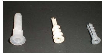
1x Drywall Anchor