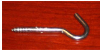
1x Screw hook