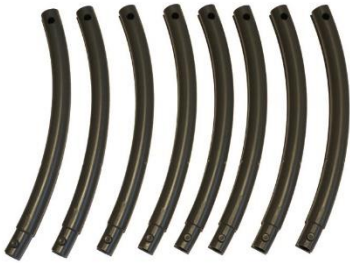
Collapsible hoop – included with Bed Canopy

Parts Required – Parts not included can be found at your local hardware store